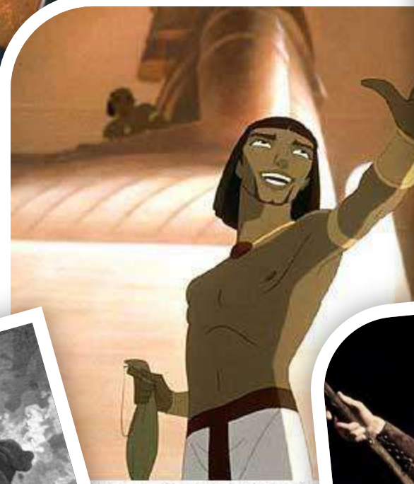
is the voice of Moses in "The